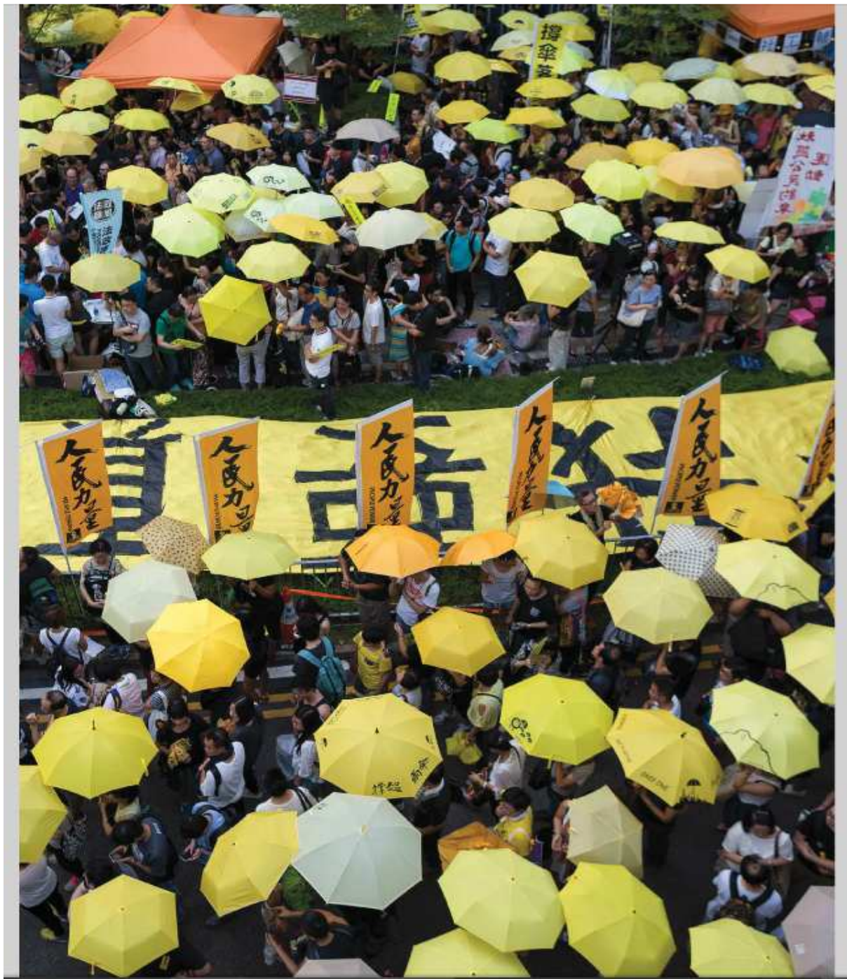
Source 1.0.1 Pro-democracy demonstrators gather to mark one year since the start of mass pro-democracy rallies calling for free leadership elections in Hong Kong on 28 September 2015. The 2014 Occupy protests began after China's central government said it would allow a popular vote for the Hong Kong leader in 2017, but insisted that candidates were vetted.

Examine source 1.0.1 and answer these questions.